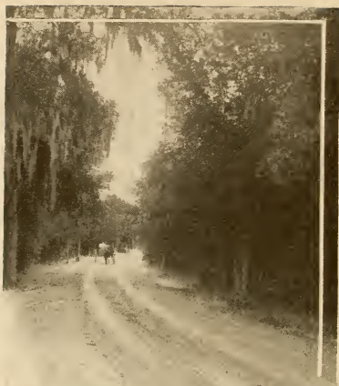
Driveway in Brackenridge Park

winding through green fields and along the meandering San Antonio river and making the trip a rare pleasure.